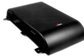
Modem Security Enclosure